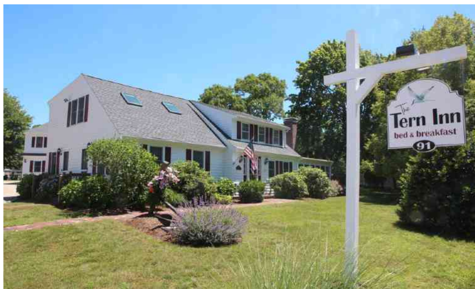
◆ The Main House ◆

12 GUEST ROOMS WITH OWNER'S QUARTERS PLUS 5 COTTAGES