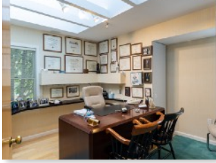
Private doctor's office with custom built-in cabinets, south facing window and sky-lights.