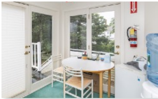
The bright, spacious staff lounge has French doors that open up to a roof-top deck.